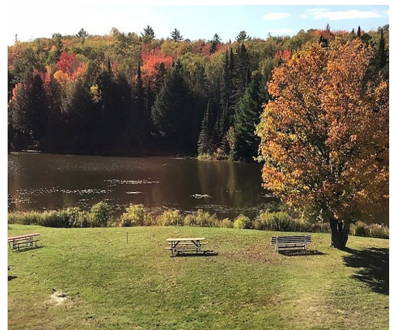
Pond, College Drive, North Bay Main Campus